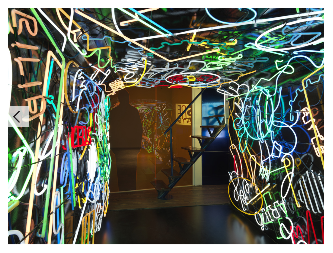
View of "Marta Minujín: Menesunda Reloaded," 2019.

Meanwhile, the institutional rhetoric surrounding "Menesunda Reloaded" courted a different kind of populism. The underlying calculus of a museum's attempt to compete with new forms of entertainment can be glimpsed in the show's brief curatorial statement. Celebrating La Menesunda 's undeniable Instagrammability, it affirms that "Minujín anticipated the contemporary obsession with participatory spaces, the lure of new pop-up museums, and the quest for an intensity of experience that defines social media today." This narrow focus on the work's proven popularity and predictable mediatization overdetermines other aspects of the show. Consider, for instance, the exhibition's title, "Menesunda Reloaded," which, in its echo of The Matrix Reloaded , crassly likens the re-creation to the lackluster second installment of a Hollywood franchise. As a brand-focused, profit-maximizing approach to film production, the franchise model has stifled the creativity and criticality of films in order to generate formulaic products with a guaranteed, highly lucrative mass appeal. Does the New Museum view its rebooting of La Menesunda —the third iteration of the work—in such a light?