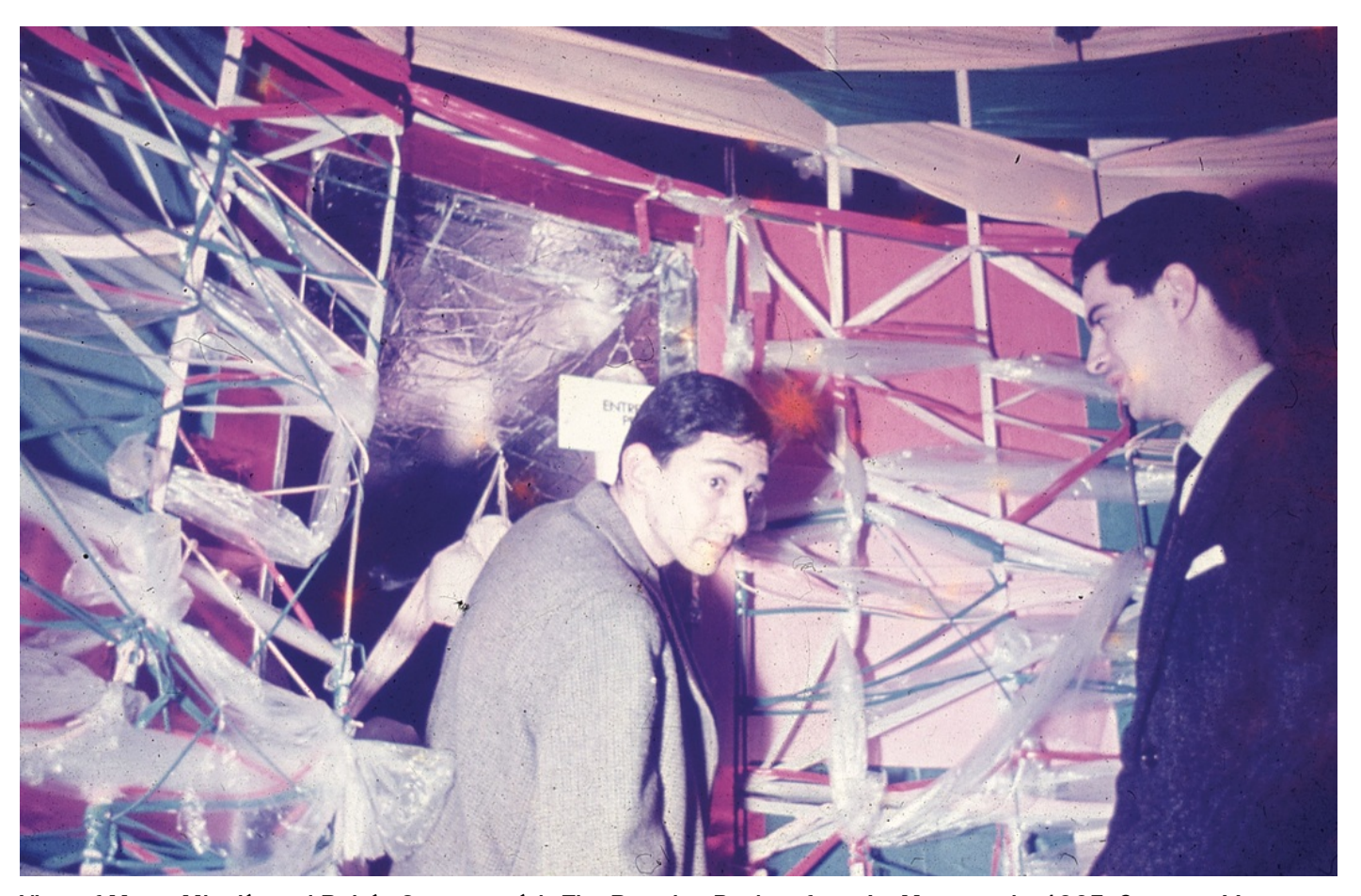
View of Marta Minujín and Rubén Santantonín's The Rotating Basket, from La Menesunda , <b>1965 .

September 17, 2019 • Michaëla de Lacaze Mohrmann on "La Menesunda"