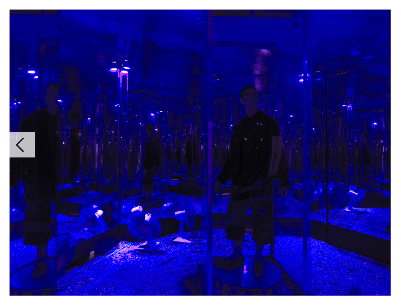
View of "Marta Minujín: Menesunda Reloaded," 2019.